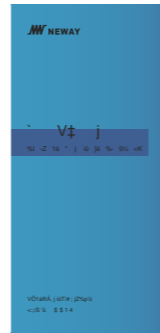
<:/S'òvÙ $ # ' 7