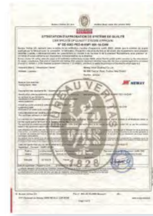
$ & 1 & %