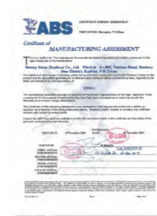
" # 4